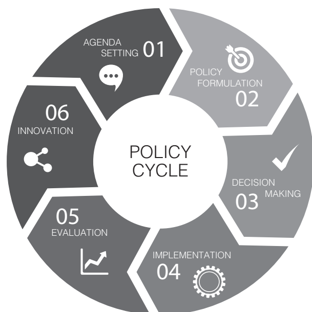
Figure 2 | The policy cycle model

It is widely acknowledged that the policy cycle model is a simplified framework to understand policy processes (Jann & Wegrich, 2007). The critique mainly focuses on understanding policy processes as developing in discrete and sequential stages. A second line of critique argues that the policy cycle model does not offer any explanation of what drives processes from one stage to another. However, the critique under-emphasises the important and successful usages of the model: it has been frequently applied both as “a yardstick for the evaluation of the (comparative) success or failure of a policy” (Jann & Wegrich, 2007, p. 58) and for contextualising case studies of single steps in the process. Based on this critique, rather than seeing the policy cycle model as an accurate representation and causal model of policy processes, we use it as a heuristic device for analytical categorization of empirical material.